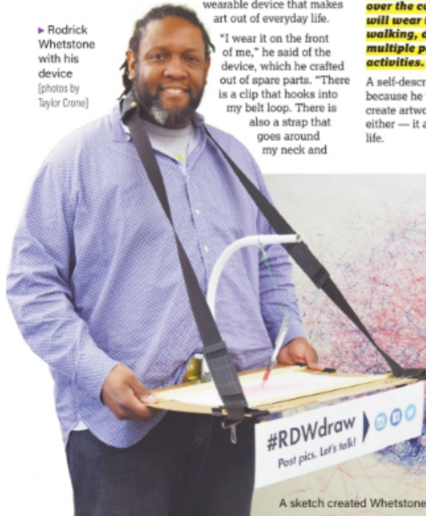
A sketch created Whetstone's machine

"I'm using an analog system for drawing. Pen and paper. We are in a digital age. So, the hashtag means to take that analog system and make it more widely available to everyone," he said. "My students can see it, I have friends and family around the country that are able to see it and keep up with my work." 📷