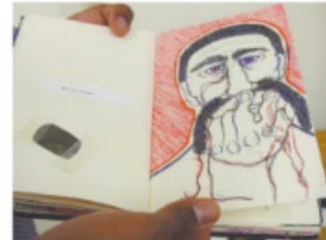
► Drawing made in his sketchbook

"The machine is based on loss of control," he said. "I've lost control in some areas of my life recently. Over the years when I go through something, I put it into art work."